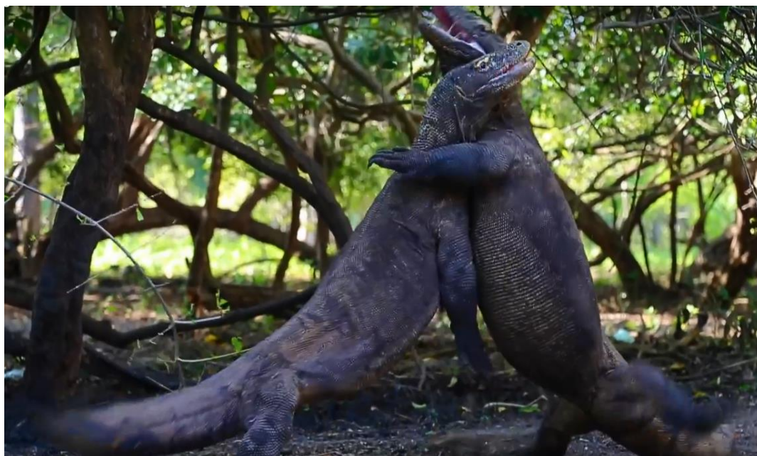
Fig. 2. Two Komodo dragons head-to-head: fighting, not foreplay. Ringside seats still available.

after 28. ... Rbd8 . Enter the dragons, KOMODO and KOMODOMCTS, over-hungry after the delay and more than ready for a fight, see Fig. 2. After much effort, the upstart newcomer overturned the seeding even more than HOUDINI, its win in the last of the eight scheduled games allowing no response.